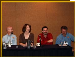
A presentation from Oregon State University colleagues