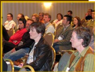
Another packed session for Tuesday's program